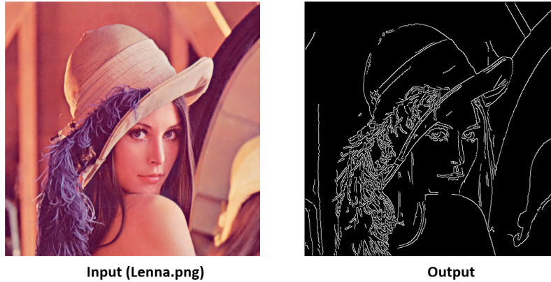
Figure 1: Canny edge detector with Lenna